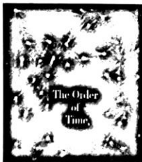
New from Carlo Rovelli